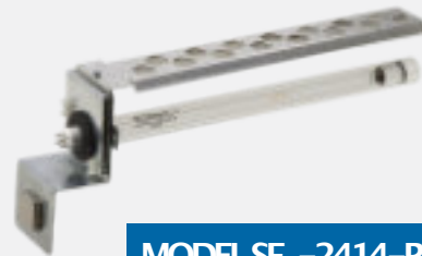
MODEL SF -2414-PREMIUM

Our standard system used for coil and surrounding air disinfection. Optional odor control lamp available for advanced purification.